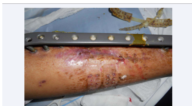
Figure 4 Day 9 after RNPT combined TopClosure treatment. It showed that the wound well recovered with the scab fall down. 2 days later, TopClosure was removed.

On 19 th Oct. The wound surface still unhealed, in the size of 7*4cm, depth 1cm. Regulated negative pressure-assisted wound therapy (RNPT) and the TopClosure system (for skin stretching and a secure wound closure) was applied to help wound repair. The open wound nearly closed on the 3 rd day after RNPT+ TopClosure surgery; it was totally closed on the 6 th day and the scab fallen down on the 9 th day.