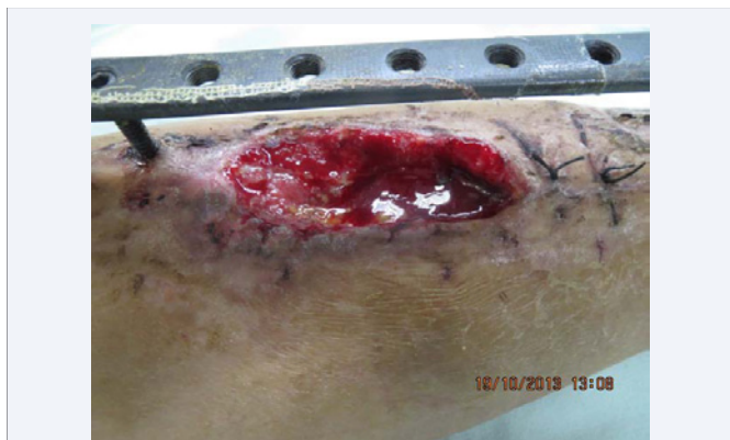
Figure 1 RNPT combined TopClosure before the treatment of right lower extremity chronic ulcer wound. 7cm×4cm×1cm in size, the surface showed relatively fresh with little necrotic tissue and exudation for the vacuum treatment before. However the growth of the wound was slow.

On 9 th Oct. The wound surface unhealed with much more exudation. “Chronic ulcer repair and vacuum drainage” was performed.