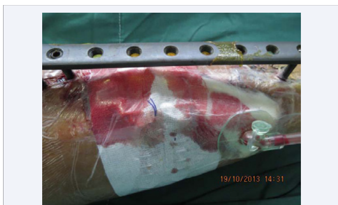
Figure 2 RNPT combined TopClosure when the surgery finished. The long arrow showed the regulated negative disc, which can avoid the secondary damage caused by duct under the vacuum. The short arrow showed the placement for TopClosure.