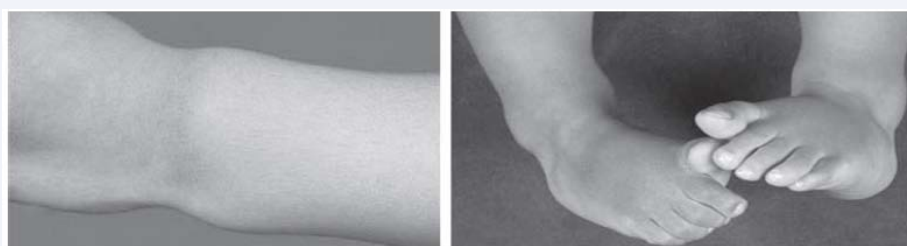
Figure 1 Clinical manifestations of vitamin D-deficient rickets. Note flaring of the distal metaphyses of the long bones.

This classification includes the most common etiologies of rickets: