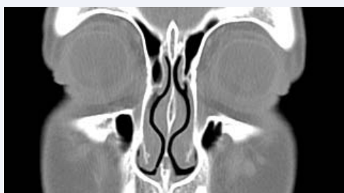
Figure 1 Nasal Septal Swell Body* (NSB) as seen on coronal CT image.

Sixty patients underwent RFA of their NSB under local anesthesia in the office-setting. Age ranged from 19-71 years, there were 38 males and 22 females, and 43/60 patients were atopic.