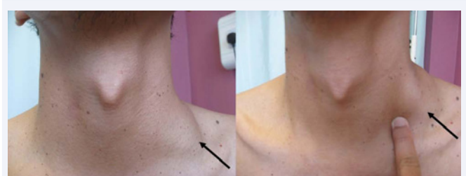
Figure 1 The above photo showed prominent left supraclavicular swelling.

well-defined hypo dense lesion seen in the left supraclavicular region (Figure 2). It measured 4.3 x 2 cm in diameter, was of fluid density and superficial to the left sternocleidomastoid muscle. The thyroid gland was normal. Blood investigations: hemoglobin 15.2 g/dL, white blood cell count 7.0 \times 10^3/\mu\text{L} , erythrocyte sedimentation rate (ESR) 22mm/hr.