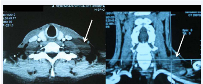
Figure 2 (A) Axial and (B) Coronal computed tomography scan of the neck showed a 6.0 cm x 5.0 cm x 3.0 cm well-defined hypo dense lesion in the left supraclavicular region.