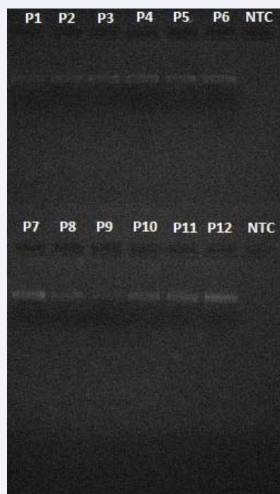
Figure 1 1% Agarose (w/v) Gel Electrophoresis : Isolated DNA Product in Human Blood Sample P1 – P12; And Control – NTC .

To genotype HCP5 rs2395029, we prepared Master Mix for PCR DNA Sequencing. the Master Mix contained 3.0 µl Patient