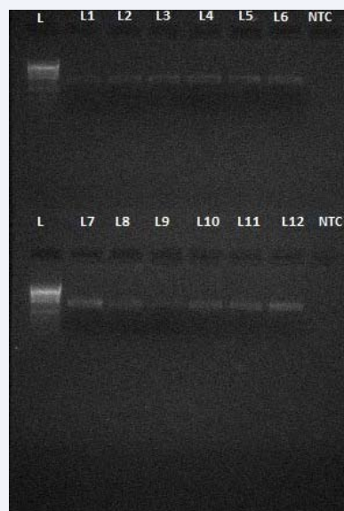
Figure 2 2% Agarose (w/v) Gel Electrophoresis of HLA-B*5701 allele PCR Purification Products for Sequencing of Patient DNA Sample: Ladder : 500 bp DNA Size standard ; Lane 1 to Lane 12 – Patients DNA PCR sample and NTC –control .

DNA Sample, Allele Specific Design Primer :HLA-B*5701 forward primer (forward: 5'-CACGAACCTCCTACCCTC -3') is 1.0 µl, Ready Reaction Mixes (R.R. Mix) 0.5 µl, Sequencing Buffer 1.8 µl SMQ 3.7 µl. We amplified a 341-bp fragment containing the rs2395029 SNP.