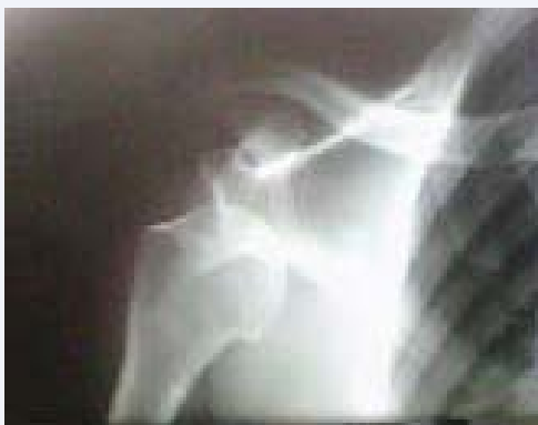
Figure 1 X-ray demonstrating subcoracoid glenohumeral dislocation.

All reductions were performed by a trained operator. After surgical scrub, including the use of sterile gloves, the operator stood facing the patient on the side of the dislocated shoulder, with the patient sitting on the examination table (see Figure 2). The operator located the glenoid cavity by palpating the acromion and the humeral head. The skin next to the empty glenoid was cleaned using 10% povidone iodine. The operator inserted a 3.5 cm, 23-gauge needle attached to a 10 mL syringe containing 2% lidocaine, into the glenoid cavity, perpendicular