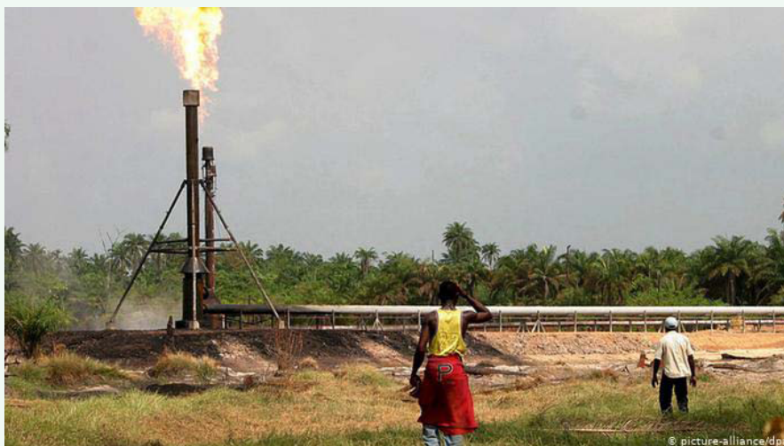
Figure 1 A gas flaring site.