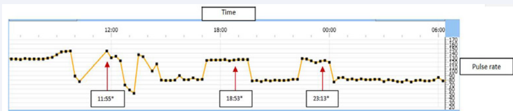
Figure 2 Heart rate response with 20-mg doses of methimazole given at indicated times (*).

role in the pharmacologic management of toxic multinodular goiter. Thionamides, including methimazole, inhibit the action of thyroperoxidase leading to reduction in iodine oxidation and subsequent formation of thyroxine and T_3 . Others have described several changes to cardiac pacemaker function by T_3 which include the enhancement of sodium and potassium permeability, sodium pump density, and the expression of L-type calcium channel 1D which act to decrease action potential duration as well as atrial/ventricular node and atrial myocardium refractory periods [2,3,4]. The low-dose methimazole initiated several days prior to transfer to our facility likely made the patient receptive to the observed effects of methimazole upward titration given several days' suppression of T_3 synthesis. Okamura, et al have demonstrated maximal serum concentrations 1.8 +/- 1.4 h and 2.3 +/- 0.8 h following single doses of 10 mg in hyperthyroid patients but report similar peak concentrations using up to 30 mg dose while others have verified an elimination half-life of 4.9 to 5.7 hours [5,6]. As illustrated in (Figure 2), administration of 20-mg doses of methimazole was associated with acute change in heart rate and rhythm in a pattern which mirrored the expected kinetics of methimazole.