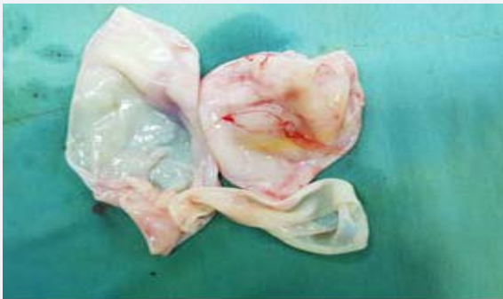
Figure 6 Show aspiration of fluid from intact cyst.

rupture are young age active patients, superficial localization of cysts and cyst diameter of > 10 cm [1,5,7,8]. Abdominal pain, nausea and vomiting, urticarial and anaphylaxis are the most common symptoms [1,3,10]. But chief complaint of our case was severe shoulder pain; we don't find such presentation in the ruptured hydatid cysts. Allergic reactions may occur in 16.7% to 25.0% patients with ruptured hydatid cysts [10,11]. Fatal anaphylaxis shock after cyst rupture has been described [7,10]. Ultrasonography and CT are the most common diagnostic methods, with 85% and 100% sensitivity, respectively, in liver hydatid cyst rupture [1,5,7,10]. CT-scan shows the most information about the position and extent of intra abdominal hydatid disease and shows other site of cysts. In our case, the diagnosis was suspected after abdominal Ultrasonography and