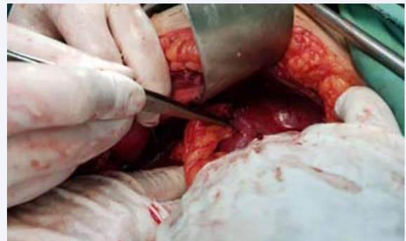
Figure 7 Show laminated membrane from intact cyst.

Rupture of hydatid cysts into the peritoneal cavity is very rare and still presents a major problem for the surgeon. This