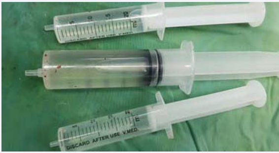
Figure 4 CT-scan of chest show infiltration in the right lower lobe of lung.