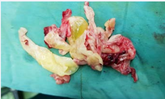
Figure 5 Show element of cyst from pritional cavity.