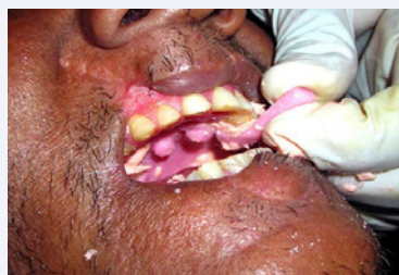
Figure 3 Impression of defect area.