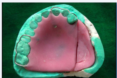
Figure 5b Defect and palatal base-plate components of obturator on final cast.