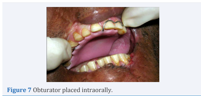
Figure 7 Obturator placed intraorally.

Instruct the patient regarding use and maintenance of the Obturator. Schedule the recall appointments for prosthesis