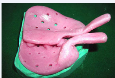
Figure 2b Sectional trays.