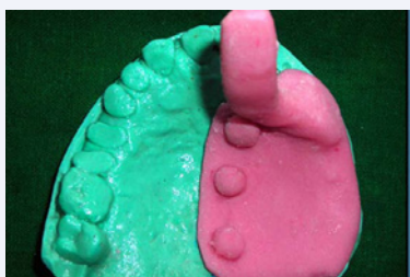
Figure 2a Fabrication of first section of the tray with interlocking indices.

Make two duplicate casts from the final casts for processing of the Obturator in heat polymerizing acrylic resin (DPI Heat-cure; Dental Products of India, Mumbai, India). Note that usually the prosthesis in such cases is a two-piece-obturator.