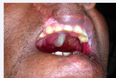
Figure 1 Acquired palatal defect and restricted mouth opening.

With previously mentioned section of the tray still in place, fabricate the tray section on normal side of primary cast. Exercise particular attention to cover the defect section tray interlockings, to allow orientation of the two sections during and after impression making. Make perforations in sectional impression trays for retention of impression material (Figure 2B).