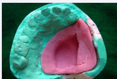
Figure 5a Defect component of obturator on final cast.