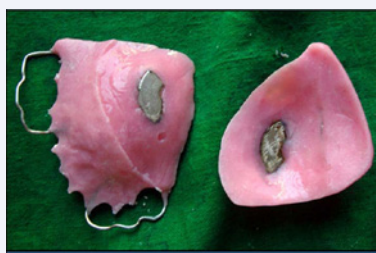
Figure 6b Two piece magnet retained interim obturator.