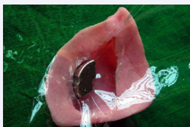
Figure 6a Attachment of the magnets.