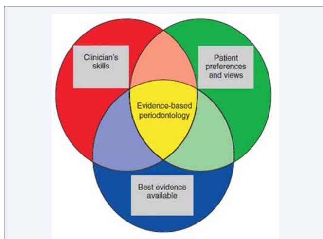
Figure 1 The elements of evidence-based periodontology.

At the patient criteria, the health problem for which the patient applies to the clinic, general health condition, age and the gender are evaluated. Especially, the choice of treatment and treatment process are more important for patients with diabetes mellitus, cancer, autoimmune diseases such as pemphigus and