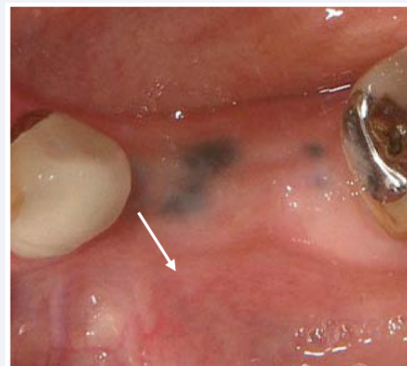
Figure 5 Intraoral photo before implants placement. Arrows indicate radiopaque findings

concerned about the pigmented gingival lesions, and we intend to fabricate an implant-supported prosthesis and observe the pigmented gingival lesions during routine checkups.