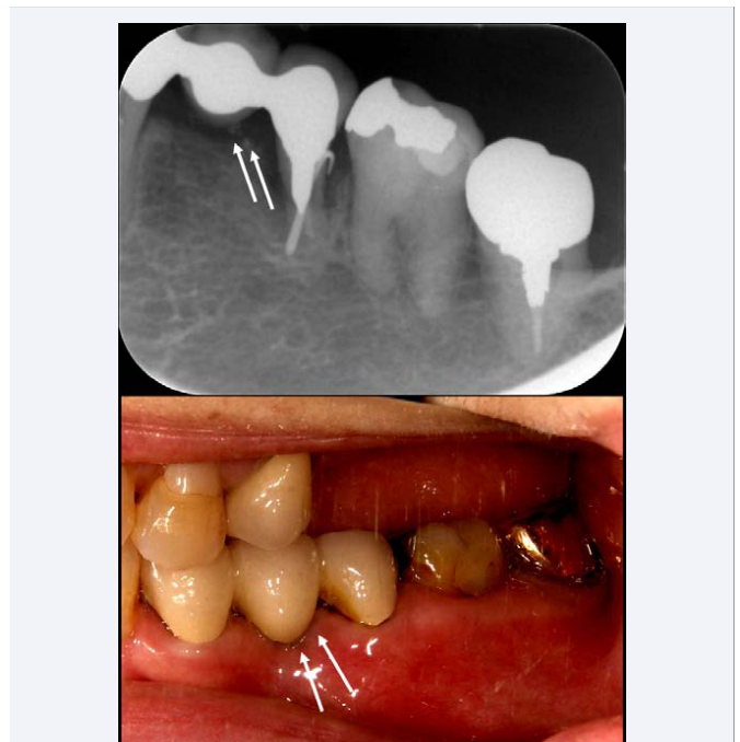
Figure 4 X-ray image and intraoral photo before extraction of tooth 35. Arrows indicate metal tattoo (A) - X-ray image. (B) - Intraoral photo

Because the site was in the molar region, the patient was not