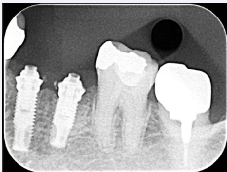
Figure 2 X-ray image at the time of abutment placement. Arrows indicate radiopaque findings.