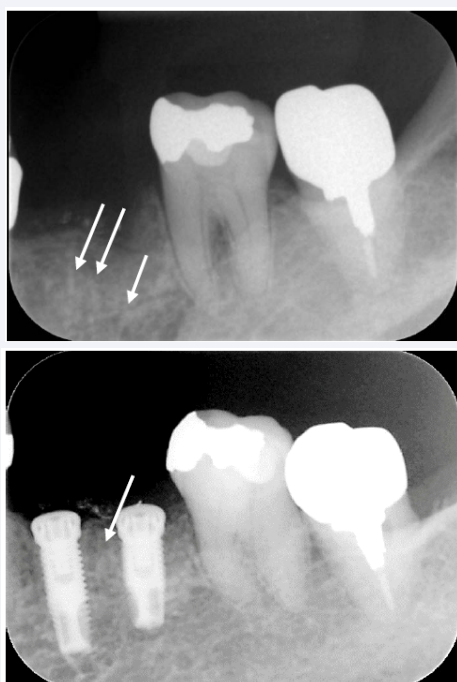
Figure 6 Comparison of X-ray image before and after implants placement