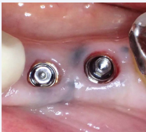
Figure 3 Intraoral photo at the time of abutment placement. Arrows indicate radiopaque findings and metal tattoo.