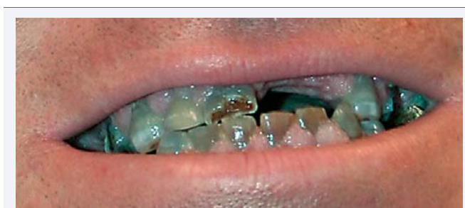
Figure 1 Dentinogenesis imperfecta (DI) in a patient with OI Type III [11].

The dental features of DI type 2 are similar to those of DI type 1 but without association of OI. The diseases (dentin dysplasia types I and II and dentinogenesis imperfecta DGI-types I to III) have been classified into two major groups with subtypes: