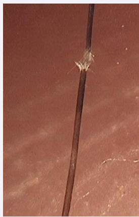
Figure 3 Hair shafts which split longitudinally into numerous small fibers, producing a picture that resembles two brushes aligned in opposition (70x)..

Americans, heat exposure and other drying agents, play a role in the development of breakage. The hair breaks in areas stressed by heating or combing [7,8].