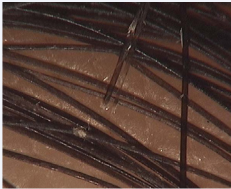
Figure 2 Area of nodular formations causes transverse fissures, where the hair can break off completely (70x).