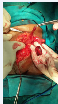
Figure 3 Friable necrotic tip of epiploica.

epiploic appendage and were not extended to the bowel wall. We were able to correctly perform an operation using the primary left inguinal approach.