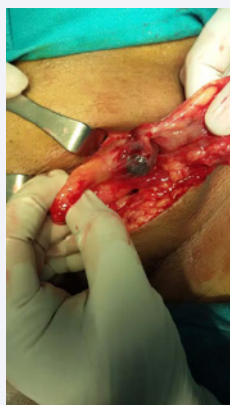
Figure 1 Findings at opening of sac.

A wide range of recent actual problems are presented in this section: the possibility of preoperative diagnosis using modern imaging techniques; the choice of the operation extent; and indications for prosthetic groin hernioplasty in complicated hernias. In some above mentioned cases, the surgeons had to convert the approach to median laparotomy to allow the correct surgical incision for an obstructive sigmoid colon resection. Fortunately, in our case, the necrotic changes were limited to the