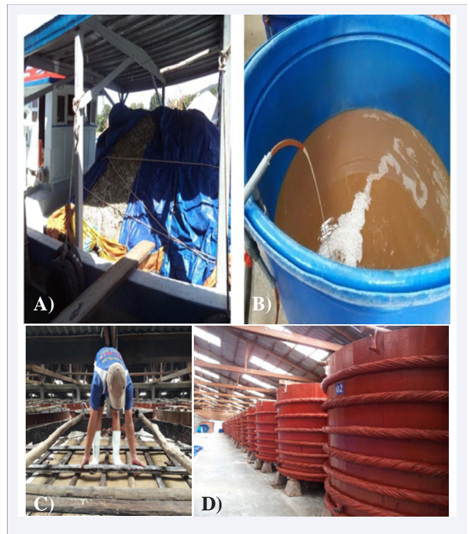
Figure 3 a) The salted anchovy inlanding, b) Recirculation of liquid from salted fish, c) Set up thewooden frame in the surface of the salted fish, d) The line of wooden vats in a traditional nuoc mam processing factory in Phu Quoc.

Besides the autolysis of enzymes in the fish, there are many bacterial communities exist in the fish sauce that their dynamic variation and their role seem unclear. In along time, based on the culture-dependent methods, many bacteria were found in the fish sauce such as Achro mobacter , Bacillus , Micrococcus , Staphylococcus , Streptococcus , Tetragenococcus and Vibrio [9,10]. For overcoming the limit of culture-dependent method in research of the sequential changes of the bacteria communities in the process of fermentation, Fukui et al. , have used both traditional method and the 16S rRNA gene clone library analysis for identification of bacteria. The results showed that the Staphylococcus species dominated in the first 4 weeks then the halophilic and high halophilic bacteria increased significant