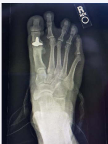
Figure 3 This is the radiograph of a patient whose initial surgery consisted of a hemi implant. The patient was not doing well with this type of implant and decided to undergo a second procedure and have it converted using the Arthrosurface total implant.