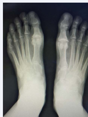
Figure 5 This patient presented as a surgical consult for bilateral hallux rigidus pain and elected to have both 1st MPJ's reconstructed with the Arthrosurface total implant.