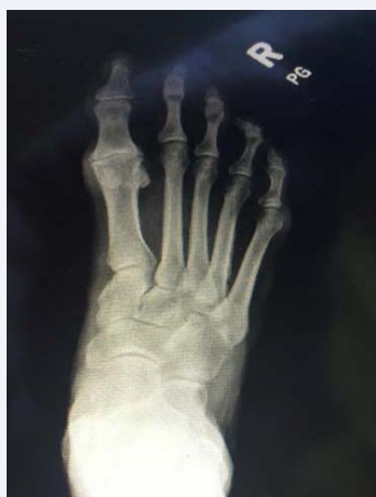
Figure 2 In this radiograph you can see the flattened appearance of the metatarsal head as well as significant joint space narrowing.