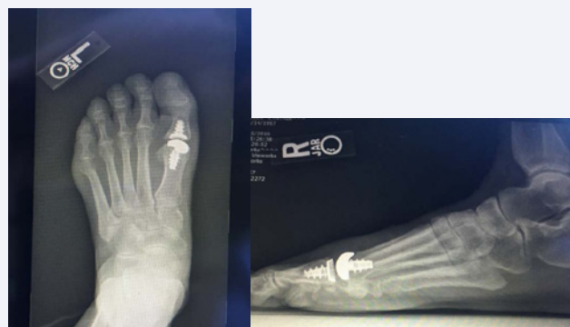
Figure 15 Both left and right foot after the surgical intervention.