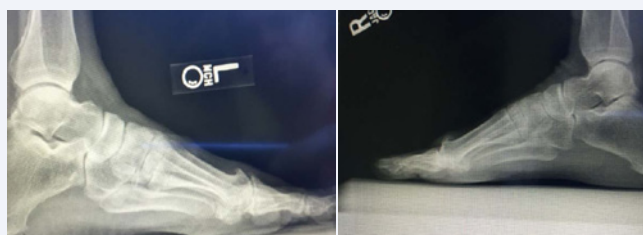
Figure 6 Right and left feet prior to 1st MPJ Arthrosurface Total Toe implant.

The patient is placed supine on the operating table, with the operative extremity in a well-padded position. The procedure can be done with either general anesthesia or monitored anesthesia care [4]. Depending on the patient, a regional block may also be utilized in the form of a popliteal or ankle block. Generally, an ankle tourniquet is also utilized along with the use of an Esmarch bandage wrapped around the foot carried to the ankle, prior to tourniquet inflation (Figure 9,10).