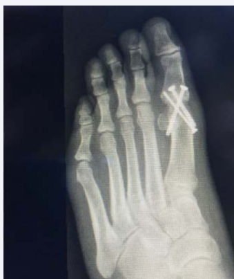
Figure 1 Pre operative Radiographs. This is a radiograph of a patient that presented to the clinic with a previous attempt at a 1st MPJ fusion that has failed. The patient elected to undergo a revisional procedure with the Arthrosurface total implant.