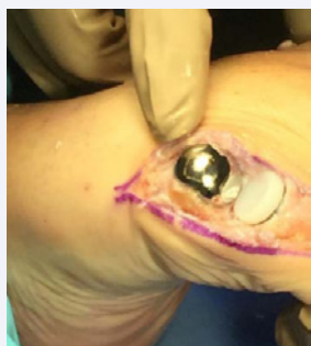
Figure 13 Final placement of the Hemi CAP DF Articular Component and DF Articular Component prior to closure.

were scheduled for 1 week, 2 weeks, 6 weeks, 3 months, and 6 months (Figure 14).