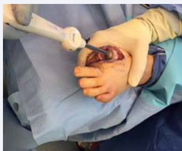
Figure 8 Drill guide is placed on the metatarsal head.