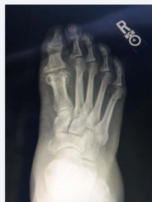
Figure 4 In this radiograph, there are substantial cystic changes occurring in the first metatarsal head. There is also a significant loss of the joint space.

For many, first MPJ arthrodesis is thought of as the gold standard for treatment of hallux limitus/ rigidus. Arthrodesis of the first metatarsophalangeal has been considered for significant degenerative changes at the first metatarsophalangeal joint and evidence of instability at the first metatarsophalangeal joint. This is done by resecting portions of the 1 st metatarsal head and the proximal phalanx then bringing those surfaces together and fixating them with screws or a combination of screws with a plate.