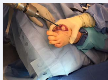
Figure 9 Wire is driven into the 1st metatarsal.