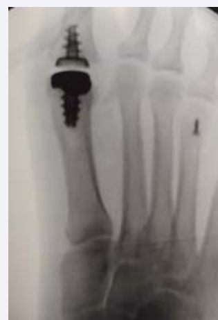
Figure 14 Checking proper implant placement and range of motion via intraoperative fluoroscopy after insertion of the Arthrosurface total toe implant.

Statistical analysis was then utilized and determined a p value of 0.152. Based on the patient scores, no statistically significant difference was found between those who had undergone a primary or secondary procedure. However, it is interesting note that while the calculated scores may be low for some, the patient was still satisfied with the outcome with the exception of one patient.