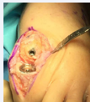
Figure 12 Insertion of both implant components.

There were 14 patients involved, (eight females and 6 males), in this study. Of the 14 patients, this was a secondary procedure for four of them. Three patients had bilateral implants placed, while 11 patients had a single implant placed for a total of 17 implants. The average age of the patient was 60.8 years with the range being from 54-69, and the median age being 61 years old. Radiographs were taken pre and post operatively to assess each patient's affected joint. Following surgical intervention, the patient's progress was reassessed in the clinic at each postoperative appointment. The postoperative appointments