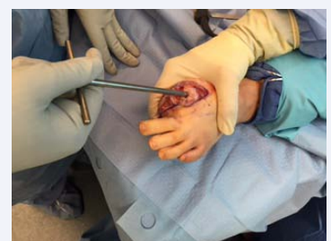
Figure 10 Surface reamer is placed over the guide pin and reamed until the laser line is flush with the cartilaginous area.