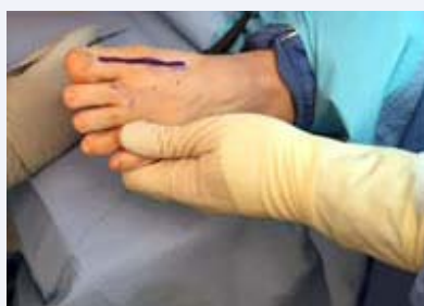
Figure 7 Incision placement. Dorsal and slightly medial to EHL tendon.

A dorsal incision is then made with a #15 blade over the first metatarsal phalangeal joint, slightly medial to the extensor hallucis longus tendon. To expose the joint capsule a combination of sharp and blunt dissection is used through the subcutaneous tissues. Care is taken to protect the neurovascular structures and electrocautery is used as needed. The extensor hallucis longus tendon is freed from the capsule and retracted laterally to keep the tendon within its sheath. A longitudinal arthrotomy is made along the medial border of the joint, and the capsule is elevated off the bone. A complete release of the collateral ligaments, sesamoidal suspension ligaments, and capsule should be made so that the entire joint, including the sesamoids, is easily visualized [5,6]. It is very important to visualize the articular edge of the sesamoid crista on the metatarsal head because this is the landmark for placement and sizing of the implant. A curved osteotome, freer or Mc Gammery elevator can be used to release these plantar adhesions. Care should be taken to avoid damage to the metatarsal-sesamoid articulation (Figure 10,11).