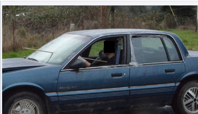
Figure 2 Photograph showing a wooden dowel placed between the bullet hole in the front windshield and the entry wound marked on the surrogate driver's chest.

The vehicle's acceleration and the laws of physics [8] were then used to determine the speed of the vehicle and the temporal sequence of the shots fired. As noted, the shooter was 7 feet in