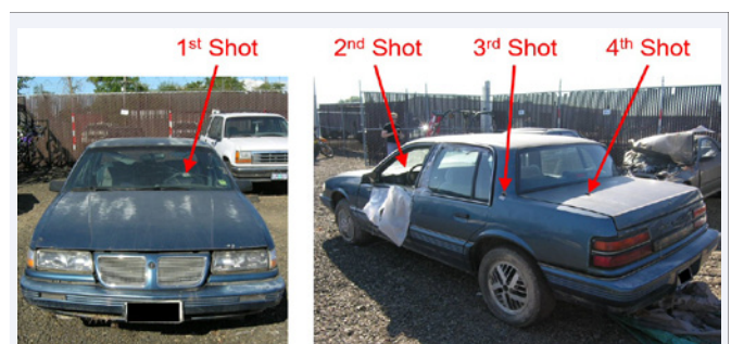
Figure 1 Vehicle photographs. The first shot was fired through the front windshield. The second shot was fired through the driver's side window. The third and fourth shots struck the vehicle's left C-pillar and trunk lid, respectively.

A surrogate study was performed to determine the position of the shooter with respect to the vehicle when the first shot was fired. Two human surrogates were used. The first surrogate was