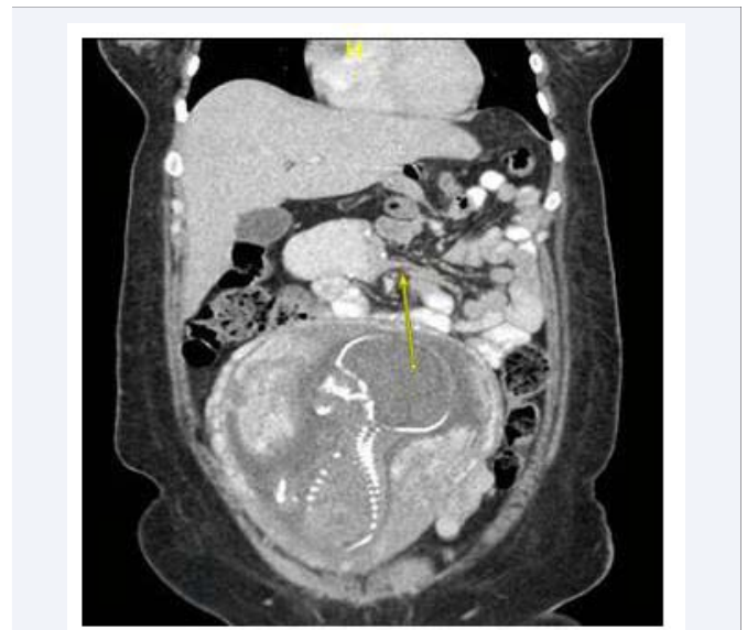
Figure 1 Arrow points to area with swirling of mesenteric vessels in the left upper quadrant concerning for herniation of the bowel through Petersen's defect.

A 35-year-old female in her 25 th week of pregnancy presented to the emergency department with abdominal pain, nausea, and vomiting for three days. She described her pain as left-sided and crampy. Although the patient experienced emesis throughout her pregnancy, it was more frequent during this episode. She had undergone laparoscopic RYGB (antecolic, antegastric) 13 months prior to presentation at an outside hospital, and she reported weight loss of over 80 pounds. The patient presented with a BMI of 22 from a preoperative BMI of 33.5. Vital signs were normal on presentation and laboratory studies revealed a lactic acid level of 3.6 mmol/L and a WBC of 21.6 K/uL. Electrolytes and hepatic function tests were normal. Abdominal exam was benign without any tenderness or peritoneal signs. A CT scan of the abdomen and pelvis with oral and intravenous contrast revealed passage of oral contrast into distal small bowel loops, however there was swirling of the mesenteric vasculature and mesenteric congestion concerning for an internal hernia (Figure 2). Given the patients concerning laboratory values and imaging, exploratory laparotomy was recommended and the patient was brought to the operating room emergently. Preoperatively, antibiotics and