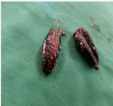
Figure 4 Two date nucleus in the Zenker's diverticulum.

myotomy or diverticulopexy, diverticular inversion and myotomy are Surgical procedures for ZD [1,3-5]. Endoscopic staple-assisted oesophago diverticulostomy, endoscopic CO 2 -laser myotomy, Endoscopic harmonic scalpel diverticulotomy and flexible endoscopic diverticulotomy are New procedures for ZD [2,6,8-10] It is believed that myotomy should always be part of surgical procedures [2,7]. In our case we used open diverticulectomy with cricopharyngealmyotomy without any complication and recurrence. In medium sized diverticula (3-5cm). Endoscopic stapling diverticulotomy is better than others less invasive approaches [2,4]. In diverticula which longer than 6 cm represent a relative contraindication to endoscopic treatment because residual pouch may be too large to allow easy clearance of pouch during swallowing [1-4] Open surgical excision in very large diverticula may still be benefit, especially in younger, good surgical candidates as our cases [8,9]. Open surgical diverticulectomy with myotomy provides radicality, eliminating any theoretical risk of carcinoma and have a low morbidity , mortality and recurrences and outcome is good as our cases we have not any of this complications [2,4-6,8].