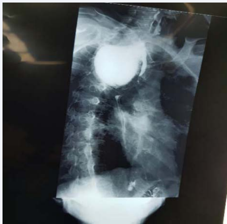
Figure 1 Anteroposterior esophagogram displaying the measures of the Zenker's diverticulum.

underwent through an another esophagogram that identified a large esophageal diverticulum (Figure 2, Figure 3). The patient positioned in a supine position with a small pillow under his shoulders and the head hyper extended and slightly turned to the right side. The operation performed under general anesthesia, the left later neck incision is made ventrally to the sternocleidomastoid muscle. Following division of the subcutaneous tissue and platysma, the pharynx and cervical oesophagus was exposed by retraction. The sternocleidomastoid and carotid sheath was retracted laterally and the larynx and thyroid gland medially. Once the pouch was identified and completely dissected from the surrounding loose connective tissue and the neck of the pouch displayed, myotomy of the cricopharyngeal muscle and proximal fibres of the oesophageal muscle was performed for a length of about 5 cm on the cervical oesophagus. Following myotomy, diverticulectomy was performed. Five days after her surgery, a barium swallow demonstrated normal swallowing function without evidence of esophageal leak or obstruction (Figure 1). Pathology demonstrated a 10 x 7 x 4cm diverticulum with two date nucleus in the diverticulum (Figure 4). The patient discharged with good conditions.