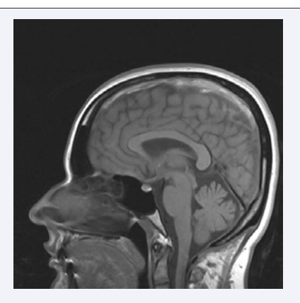
Figure 3 MRV showing a dense area in the superior sagittal sinus.

classically described as slow-onset, dull, localized and worse with recumbency. Some CVST case reports alternatively describe thunder-clap type headaches without the classic positional component. In the most expansive study to date, 37% of patients had some type of focal motor weakness and 39% had seizures on initial presentation [1]. Seizures are more common in the CVST cases with more indolent, chronic presentation and large clot burden. The diversity of symptoms means patients with CVST have the potential to present to any variety of acute, primary care or subspecialist settings. Clinicians must have a high index of suspicion when presented with patients with acute debilitating headaches.