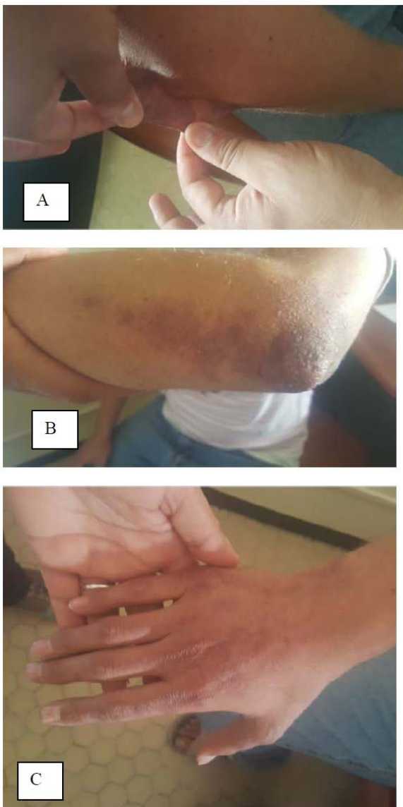
Figure 1 [A] hyper elasticity of the skin; [B and C] hematomas in the elbow and the hand resulting of repeated minor traumas.

The first two cases that have been reported in 2000 redof two children and whose epilepsy was symptomatic of polymicrogyria. In one case seizures were drug resistant. In 2005 Ezzeddine and al [20] described an uncommon association between EDS and bilateral frontal polymicrogyria in a 3-years girl in which neuropsychological assessment highlighted an overall delay of acquisitions with many arguments of a frontal syndrome (hyperkinetic, attention deficit, unpredictable mood swings, imitative behavior, perseveration). In 2014 Verroti and al [12] studied 42 patients with EDS, in this cases epilepsy was frequently associated with periventricular heterotopias (PH) and only two patients have polymicrogyria (Table 1) [6,23]. These reports suggest a likely increased rate of epilepsy in EDS. The association of EDS type IV with a disorder of cortical organization such as Polymicrogyria was due to abnormalities of the synthesis of various extracellular matrix (ECM) [18]. Collagen seem to have an important role for neurological growth, migration, metabolism and differentiation [24]. Some authors suggest that the interaction between epidermal growth factors and ECM are