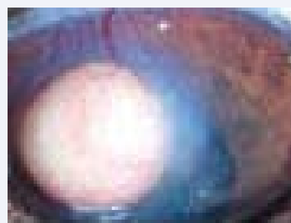
Figure 1 Upper temporal quadrant of the Cornea.

The corneal epithelial inclusion cyst can develop after