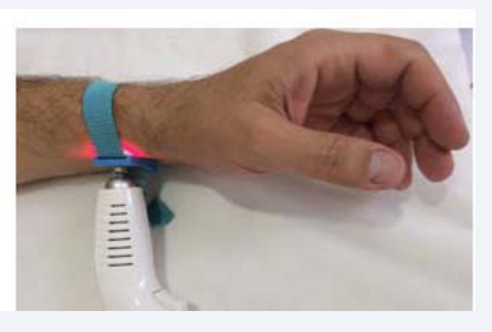
Figure 2 ILIB (intravascular laser irradiation of blood) therapy on the left wrist.