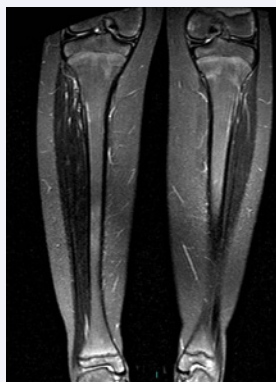
Figure 3 MRI at 3 months follow up demonstrating resolution of the marrow oedema in the proximal right tibial metaphysis. A little residual oedema persists in the proximal left tibial metaphysis.