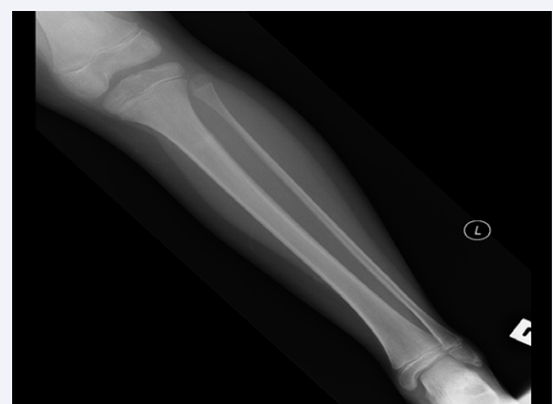
Figure 1 Initial radiograph demonstrating a lack of clarity of a small area of the lateral cortex of the proximal tibia, associated with an impression of a mildly sclerotic horizontal band.

Initial radiographs of the tibia and fibula demonstrated a mildly sclerotic band in the proximal left tibia, potentially indicative of stress fracture (Figure 1). Following this magnetic resonance imaging (MRI) of the lower limb was performed to confirm the diagnosis and exclude more sinister pathologies. MRI of the tibia and fibula demonstrated high signal changes within the proximal tibia in the meta-diaphyseal region with evidence of some cortical thickening and linear low signal areas seen in