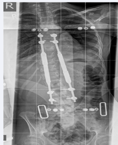
Figure 2 Postoperative radiograph after treatment with MCGR. Cobb angle is 15° (correction 78%), initial lengthening of 12%.

Within a mean FU period of 9.5 months, there were three complications in patients who had MCGR as a primary procedure (Table 1); one patient developed wound infection that was successfully treated with debridement and parenteral antibiotics. Two patients had pull-out of proximal screws 3 weeks and 8 months postoperatively. In the patients who had MCGR as a revision procedure there were two complications. One patient sustained a fracture of a single-rod construct 6 months after surgery and was converted to a double magnetic rod construct. The other case was already complicated with PJK after treatment by VEPTR. The same problem occurred again after conversion to MCGR. This led at the end to shortening of spinal length and