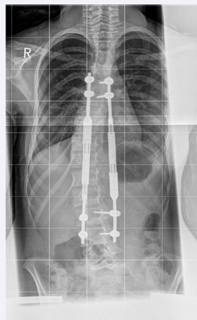
Figure 3 Radiograph at FFU (13 month) with Cobb angle of 15° and spinal length of 405 mm.