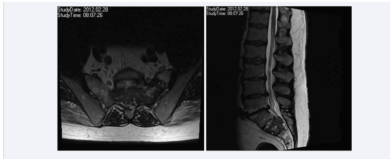
Figure 2 (a&b) MRI of the sacrum showing a massive infiltration of the bone with destruction of the cortex.