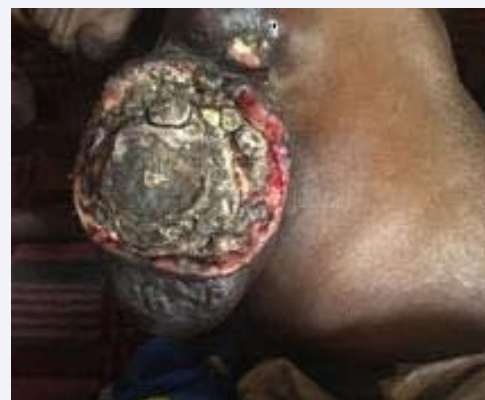
Figure 1 A patient with an advanced breast tumour.

Other treatment protocols such as chemo- and radiotherapy