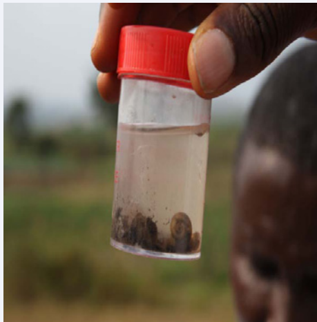
Figure 1 Snails.