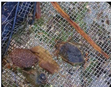
Figure 3 The big water bug.

is a commodity used by people in the area, particularly Hilat Dauod to build houses. Water is fetched from the canal for the purpose.