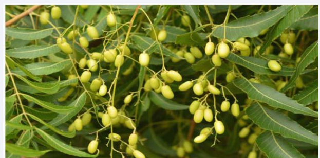
Figure 4 Neem.