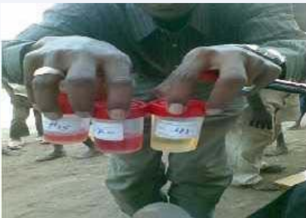
Image Macroscopic Haematuria.

fishing a survival strategy necessary to be conducted against poverty and scarcity of food. Fish provides a cheap meal to kill their hunger. When the researchers conducted the study it was "okra harvesting season". Harvest is mainly done by female-villagers, for that reason mothers were usually at the agricultural sites when the boys go home at the end of the school day. Mothers at Habiba village do not go harvesting. Thus, children find mothers at home after school, a twelve year old boy asserted, "When I go home my mother gives me madida (an indigenous drink made of flour and water), this kills the hunger immediately". The researchers observed that hands are also so often plunged in water during the activity to pick the snails; the flesh of snails is used as bait for the fishing activity.