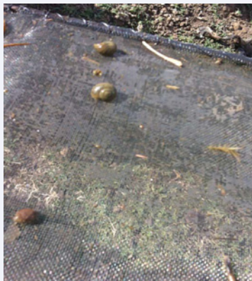
Figure 2 Snails.