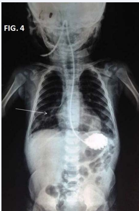
Figure 4 Shows Gastrografin study with right sided homogenous opacities suggestive of right side spillage.

preferred especially not complicated with sepsis. The patients selected for conservative treatment are those with small perforations [12]. contamination confined to mediastinum and late recognition ( more than 24hrs) of an esophageal perforation, as the surgical mortality at 24hrs becomes equals to that of conservative approach [10].The principles of conservative treatment consisted of a) Nil oral regimen) Continuous Naso gastric suction c)Pleural drainage, d)Broad spectrum antibiotic usage, e) Feeding enterostomy or total parental nutrition [10]. Our patient was too small and in a precarious state, and it took us 36 hrs to resuscitate him from acute renal failure, and shock. Contamination was minimal, and he was managed conservatively. In addition a continuous drainage of emphysema was carried out with under water seal drain which helped in reducing the respiratory embarrassment.