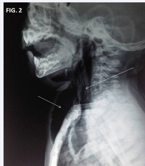
Figure 2 Shows Subcutaneous and Paratracheal Emphysema.