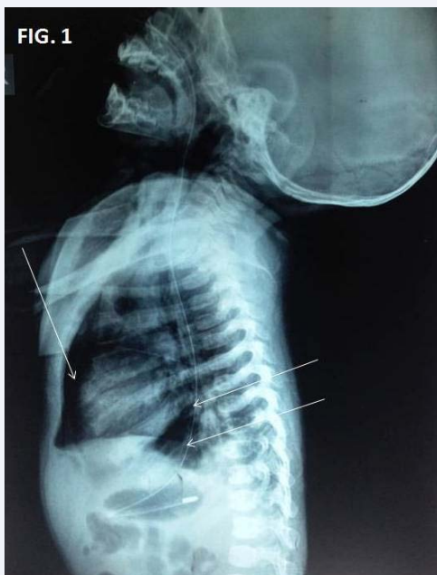
Figure 1 Shows Precardial and Retrocardial Emphysema ( Pneumo-Mediastinum) with 'V' sign of Naclerio.

Boerhaave's syndrome is rare in children [6]. Till date only 28 cases were reported in literature. In a similar case as ours Antonio et al confirmed the rent in the esophagus and diagnosis can be established only by esophagoscopy [6,23].