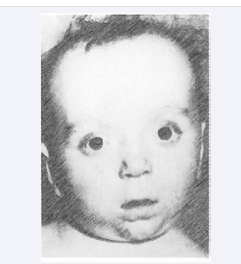
Figure 1 A sketch of the facial dysmorphism of Weaver syndrome which include broad forehead and face, large ears, hypertelorism, and, micrognathia.

We have previously described our pioneering extensive experiences with clinical genetics and dysmorphology in a plethora of publications. We have previously reported a large number of rare conditions in Iraq [6-14], and we have also helped physicians in the diagnosis and publication of rare syndromes observed in other countries [15]. The aim of this papers is to help clinicians in advancing the diagnostic skills in the field of clinical syndromes by reviewing briefly a rare syndrome that have not been reported in Iraq, but it is associated with certain clinical characteristics that allow clinicians who see the syndrome for the first time, capable of making an easy diagnosis by knowing few information about the condition.