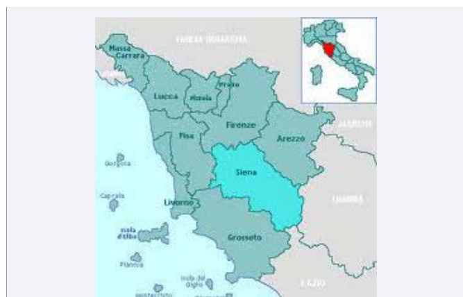
Figure 1 Province of Siena-Tuscany-Italy.

In 2012 601 psychiatric inpatient admissions were made,