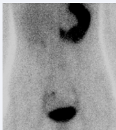
Figure 1 Sequential planar scintigraphy shows a subtle focus of activity within the right hemiabdomen (arrows) (sequence 25-30 minutes post-injection).

Technetium-99m pertechnetate scintigraphy is commonly