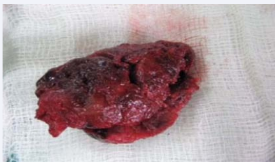
Figure 2 A large red polypoid mass with smooth outer surface within endometrial cavity.