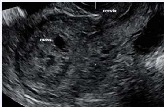
Figure 1 Inhomogenous hypoechoic intrauterine lesion with cystic degeneration suggestive of myoma.