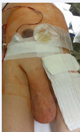
Figure 6 Result at the end of the operation.