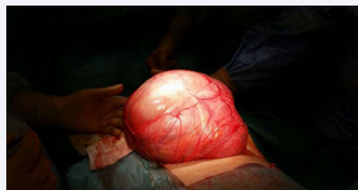
Figure 4 Intraoperative illustration of the hernial sac.