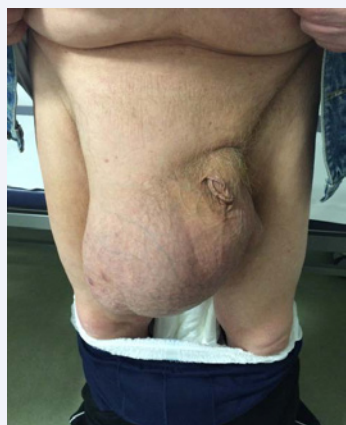
Figure 1 Preoperative finding.

To control the pain during the procedure, a peridural catheter was perioperatively applied and fitted with Ropivacain™ 0, 2%. With an open approach we placed a 10 mm laparoscopic camera port in general anesthesia in the left flank. The explorative laparoscopy showed no further pathologies than the known hernia.