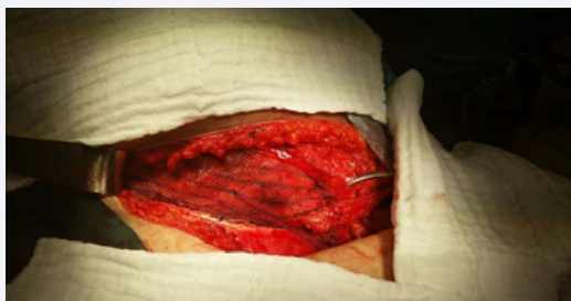
Figure 5 Position of the mesh after Lichtenstein operation.