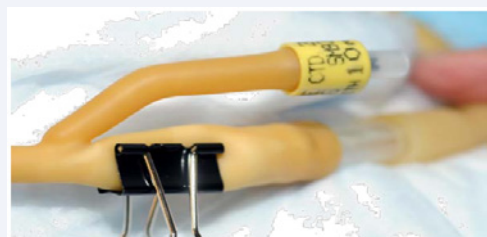
Figure 1 The clamp is placed at the junction of the Foley catheter where it connects to the drainage bag tube, and left in place until the catheter is ready to be removed.

Swab the meatus and insert the lubricated new Foley catheter using the forceps with the dominant hand. Continue to thread the catheter until urine comes out of the catheter end. Push the catheter in another 2-3cms. At this point, you can be assured that