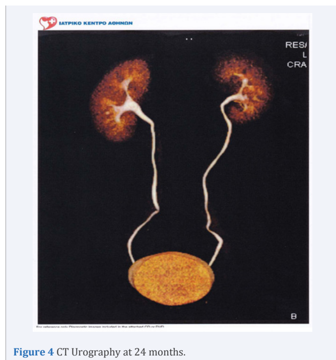
Figure 4 CT Urography at 24 months.

fistula after partial nephrectomy, as it can cause hyponatremia and renal function impairment.