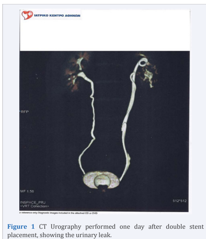
Figure 1 CT Urography performed one day after double stent placement, showing the urinary leak.

Urine leakage is an undesirable complication after partial nephrectomy, which can usually resolve by drainage with a ureteral stent. However, in some cases it is possible that a single stent may not be able to drain adequately. According to Kundu et al. , 69% of the patients with urine leak will heal spontaneously with conservative treatment (drain, good nutrition, rest and exercise to promote healing) in the absence of clinical symptoms.