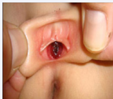
Figure 2 Purple pseudo tumour swelling in a girl of 07 years.

Initial treatment consisted of parental reassurance that urethral prolapse was a benign urological pathology and not sexual abuse.