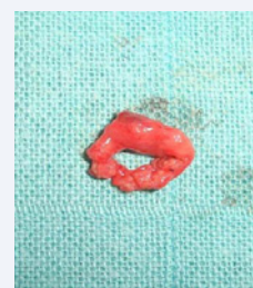
Figure 4 The Excised Ring prolapsed mucosa and suture.