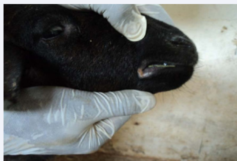
Figure 1 An experimentally infected sheep having ulcerated oral lesions at the commissure of the mouth on day 12 post infection. [Courtesy: Maina et al., 2015] [58].

These observations are predominant particularly during acute phase of disease [53]. The number of eosinophils may remain unaltered because these cells are primarily associated with parasitic infections [54]. On the other hand; the vaccine virus induces only a transient lymphopenia without significantly affecting the immune response to nonspecific antigen or to itself. As diarrhea develops there is a progressive hemo-concentration and low serum sodium and potassium.