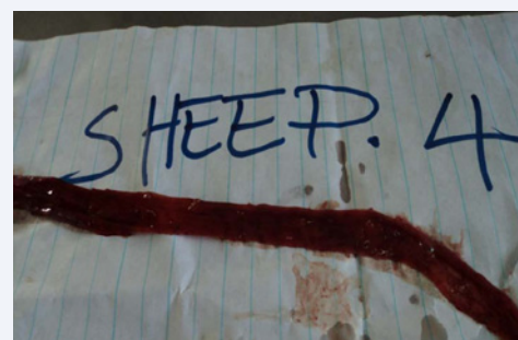
Figure 4 Intestinal mucosa from an experimentally infected sheep appearing severely congested.