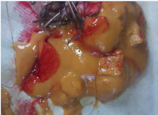
Figure 3 Surgically removed egg yolk material from a hen suffering from Egg peritonitis

administer a hormonal implant that is inserted into the chicken's neck or breast. The implant effectively stops the hen from laying and so the Egg peritonitis symptoms will disappear [30]. To control the Egg peritonitis fecal contamination with E. coli should be minimized [10,18,19]. Moreover, keeping flocks under sufficient space (for exercise), good sanitation and biosecurity practices are the key prevention approaches recommended [4,8,12].