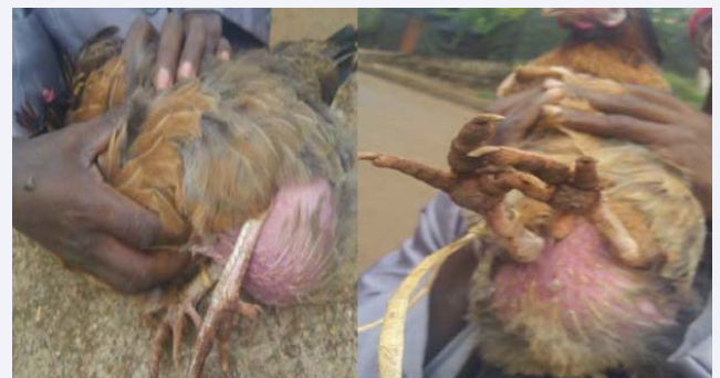
Figure 2 Distended abdomen of a chicken due to Egg peritonitis

repair itself plus antibiotics to prevent further infection. Chickens with non-septic Egg peritonitis can be treated with supportive fluid and additionally antibiotics may be administered in order to prevent secondary bacterial complications. Patients with ascitic fluid may need to have an abdominocentesis to have all the fluid removed [14].